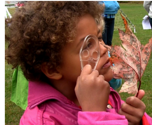
A closer look at leaves

Each submission must have all the necessary rights and model releases and be the right of the person or persons who submit the picture and not derived or copied from another website or artist.