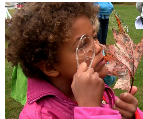
A closer look at leaves

Each submission must have all the necessary rights and model releases and be the right of the person or persons who submit the picture and not derived or copied from another website or artist.